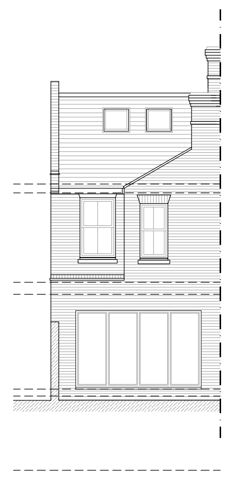
Rear (South-East Facing) Elevation 1:100